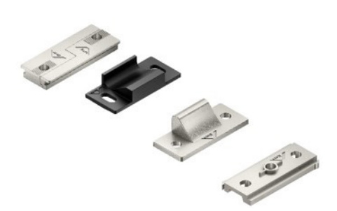
Concealed Centre Lock(s)