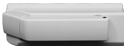
X16 Metal Cover Cap & X16 Crank Handle