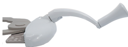
Easy-Grip Crank Handle