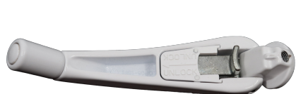
X10 Lockout Crank Handle (compatible with X15, X19, and X16 cover caps)