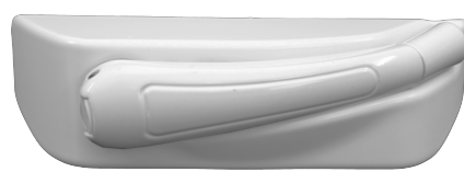
X19 Metal Cover Cap & X6 Crank Handle