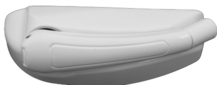
X15 Cover Cap & X6 Crank Handle (cover caps available in metal & plastic)