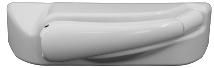
Removable Cover Cap & Crank Handle