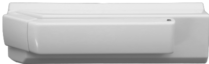
Contemporary Cover Cap & Crank Handle